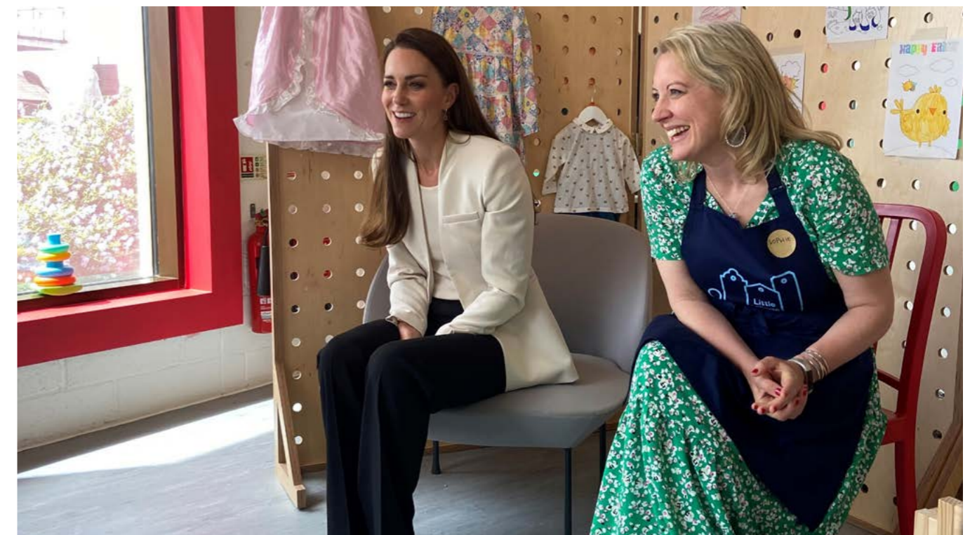
Above: HRH The Princess of Wales visiting Little Village

Little Village supports families with babies and children under five living in poverty across London.